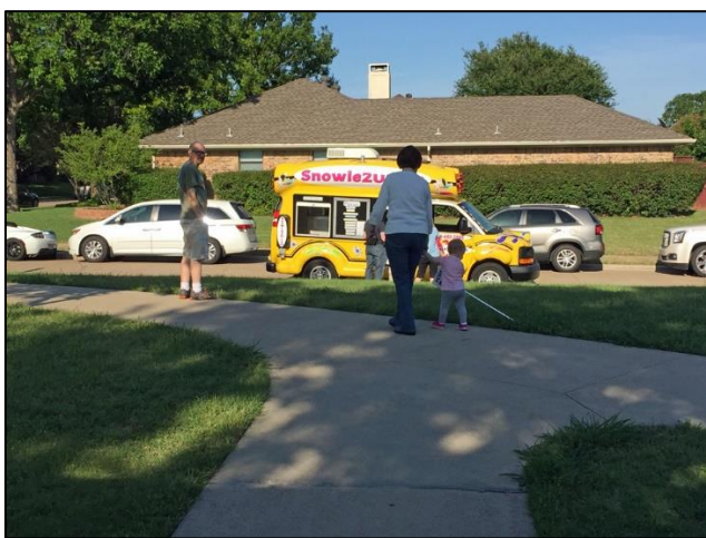
Picnic in the Park – May 2016